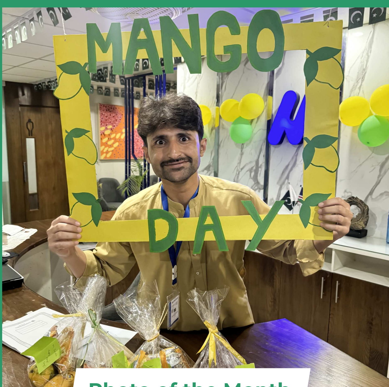
Photo of the Month

Submit your photos to HR Department for our next month newsletter, and let's make our newsletter even more vibrant and fun together!